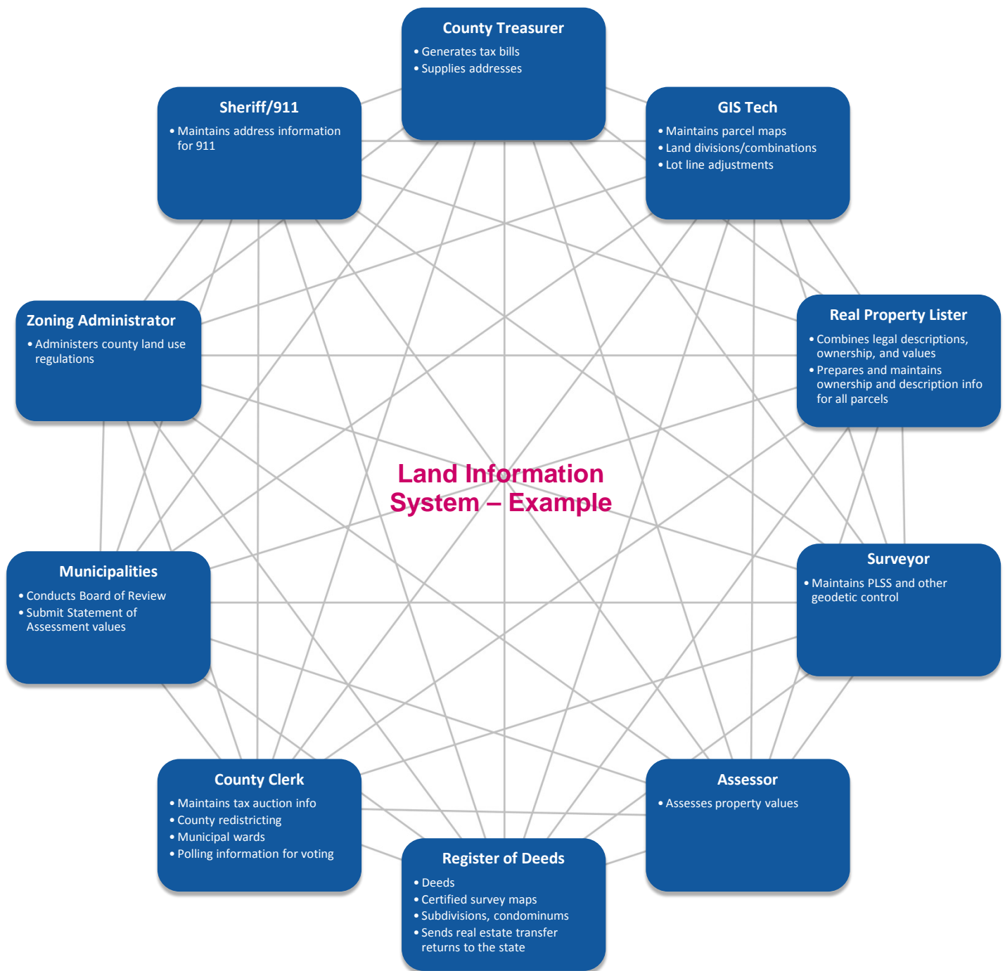
Figure 1. Badger County Land Information System